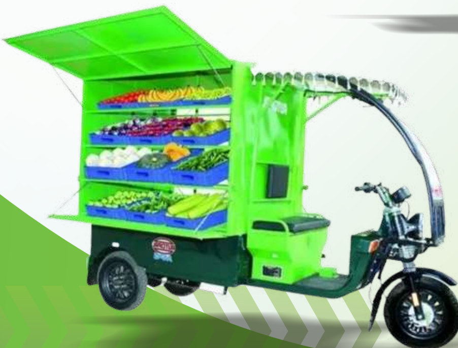
EWA VEGETABLE CART