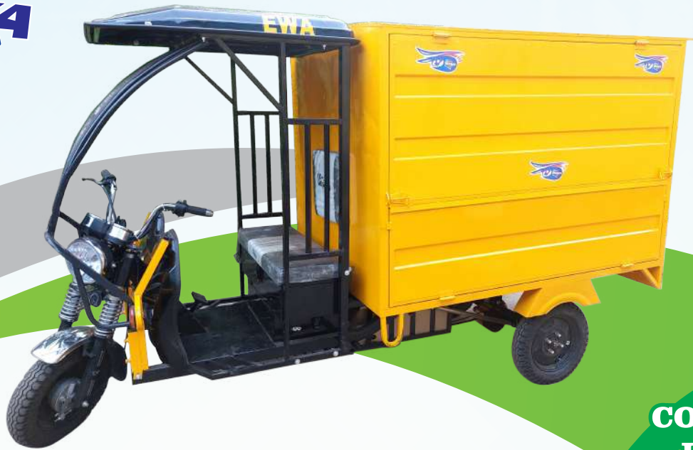
EWA CONTAINER LOADER